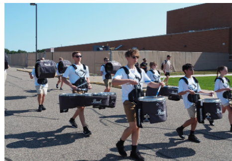
Andover High School Marching Band