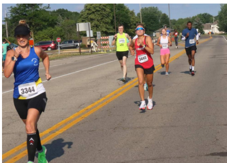
5K Fun Run

As a committee of volunteers, the success of the AFFF depends on the help of the community. We are in need of event leads next year – if interested in hearing more, please reach out on our Facebook page: Andover Family Fun Fest, or visit our site: https://www.andovermn.gov > Our Community > Andover Family Fun Fest.