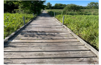
Kelsey Round Lake Park Boardwalk

A new playground at Lund's North Park was added this year as well. The aging main parking lot at Sunshine Park was reconstructed in July and is back open for use. Also new this year will be a medium sized shelter