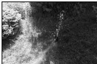
REPLACE BROKEN AND LEAKY SPRINKLERS

Run each irrigation zone. Look for broken sprinklers, low water pressure and arcs or angles of water spray that put water where it isn’t needed (i.e. on streets). Replace sprinklers, correct water pressure accordingly, and correct spray angles.