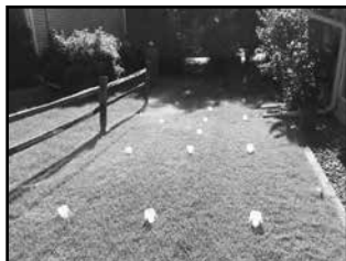
PLACE CATCH CANS ON A GRID PATTERN

Place tuna or coffee cans on the lawn in an evenly spaced grid pattern throughout an individual irrigation zone. Place them roughly 5 to 8 feet apart for small area spray-sprinklers and 10 to 20 feet apart for large area rotor-type sprinklers. A minimum of 20 cans should be used for each zone—the more cans, the better the accuracy. Run the zone for a set amount of time (30-60 minutes). A longer run-time provides more accurate results. Next, measure and record the depth in inches of water in each can. Repeat for each zone.