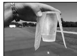
MEASURE THE DEPTH OF WATER IN EACH CAN

To find out what the precipitation rate is in each irrigation zone, calculate the average depth of water in the catch cans for one hour of run time. For example, if the average depth of our 20 cans is 0.75 inches after 30 minutes, our precipitation rate is 1.5 inches per hour. To get more uniform